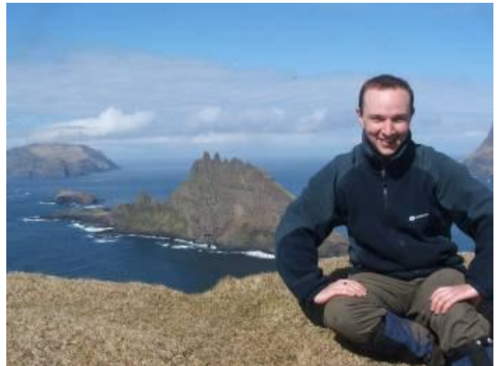
Tindholmur, Faroe Islands