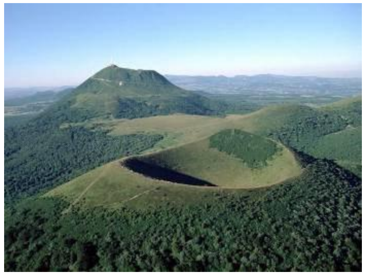
La Chaîne de Puys, Auvergne