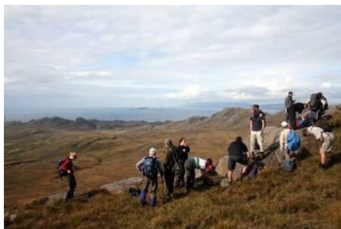
The centre 3 gabbros of Ardnamurchan.