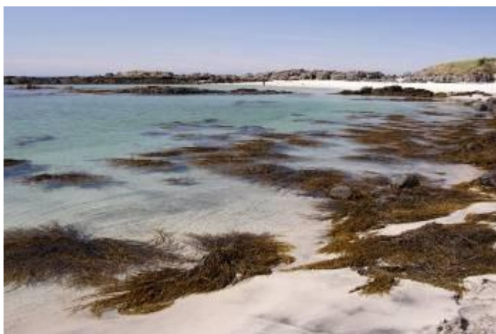
Typical Scottish weather in September!