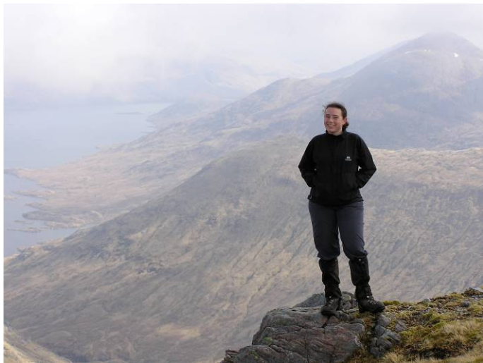
The Boss!