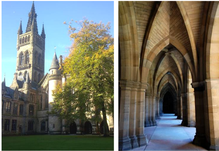
University of Glasgow