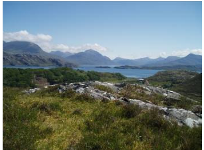
Loch Torridon, with Lewisian Gneiss in the foreground, NW Scotland

See: http://www.geolsoc.org.uk/gsl/events/listings/page4658.html