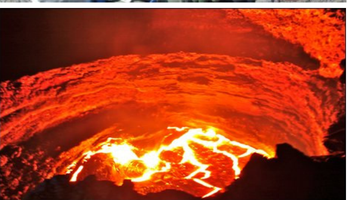
Dougal Jerram at Erte Ale, Ethiopia, and its stunning lava lake